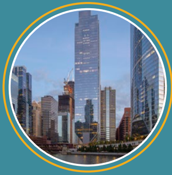
150 NORTH RIVERSIDE