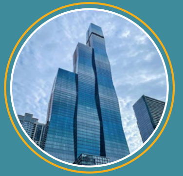
ST. REGIS CHICAGO