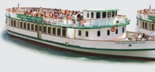
CHICAGO'S LEADING LADY 2011