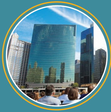
333 WEST WACKER