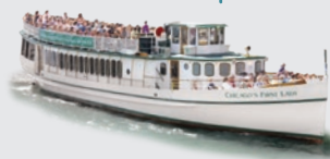
CHICAGO'S FIRST LADY 1991