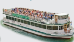
CHICAGO'S FAIR LADY 2006